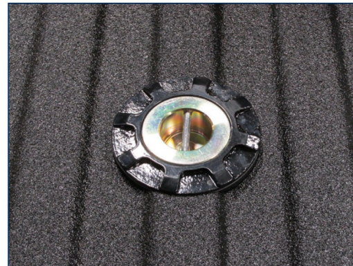
Flip. Invert to store.