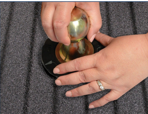
Twist. Rotate the collar.