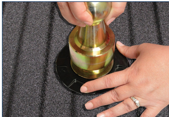
Pull. Pull out the hitch ball.